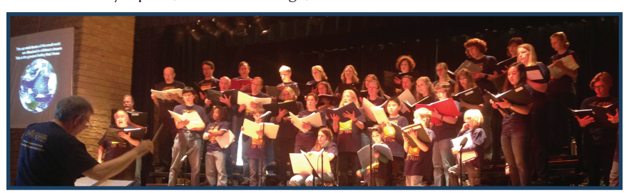
Powers of Ten by David Haines, 2014

Songs of Life and Evolution (performed by NCFO in 2007 and 2012) and Powers of Ten (performed by NCFO in 2008 and 2014) are entirely science-based. David's unique musical style reflects numerous musical influences—from the Beatles to Bach, Britten to the Beach Boys. NCFO also performed David's family opera, The Puzzle Jigs, in 2003 and 2008.